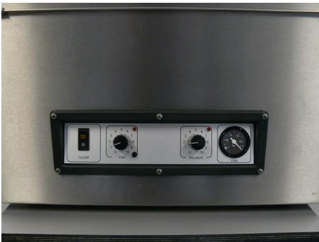
Present situation, analogue front panel

set contains: # 8000102 complete panel holder with On/Off switch, meter and digital PCB