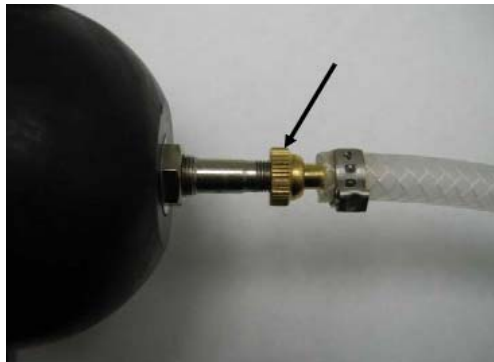
Fitting shown on expansion tank Figure 1

Please call 1-866-323-2777 and ask for customer service if you would like to order parts or kits.