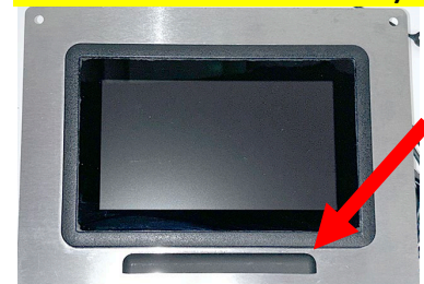
Figure 2 Front of Replacement Controller for Older Style Controllers with Cooling Louver