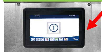
Figure 4 Newer FQ4000 Touch Screen Controller (Metal Bezel Surround)