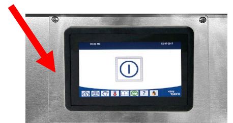
Newer FQ4000 Touch Screen Controller (Metal Bezel Surround)