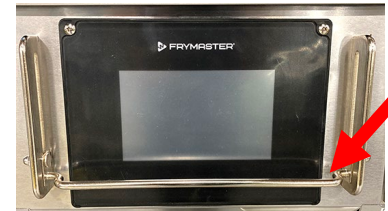
Figure 1 Older Style FQ4000 Touch Screen Controller (Large Wide Black Plastic Surround)

The new touch screen vat ID locator is selected in the software instead of the traditional hardwired 6-pin locator. The selection is made at HOME>SERVICE>SERVICE>3000 or 1650>TECH MODES>SELECT VAT ID.