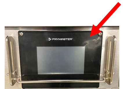
Prior Older Style FQ4000 Touch Screen Controller (Large Black Plastic Surround)